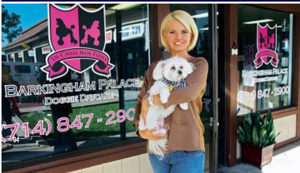
JUMPER: ZARA; JEANS: J BRAND