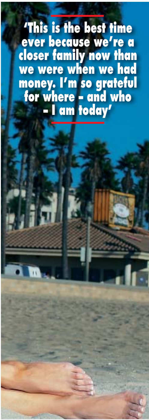
(LEFT) DRESS: ME & BLUE. (RIGHT) TOP: ZARA

'This is the best time ever because we're a closer family now than we were when we had money. I'm so grateful for where - and who - I am today'